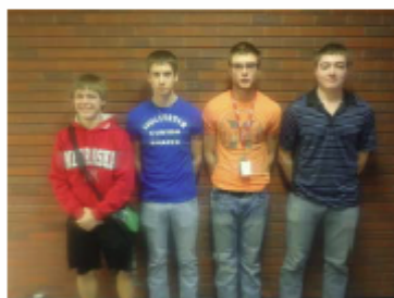
State Qualifiers for Meats Team